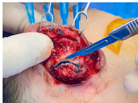
Fig. 2. On the posterior surface of the auricle, at the level of the conchal bowl, the incision is seen precisely at the area previously tattooed on the anterior surface. This serves to weaken the cartilaginous structure between the concha and the antihelix and to reduce its tissular memory.