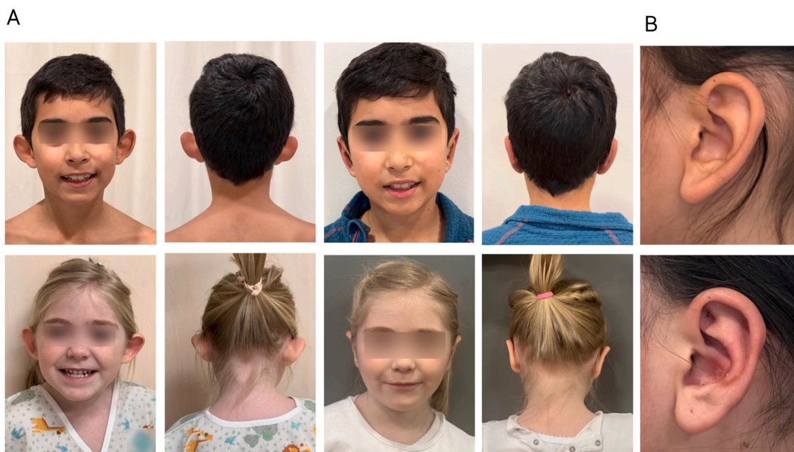
Fig. 3. A. Pre- and postoperative comparison of prominent ears treated with the described technique. Strasser score: 2 points.

B. Long-term outcome of the reconstructed neoantihelix. The goal is to achieve a natural-appearing antihelix without visible indicators of surgical reconstruction.